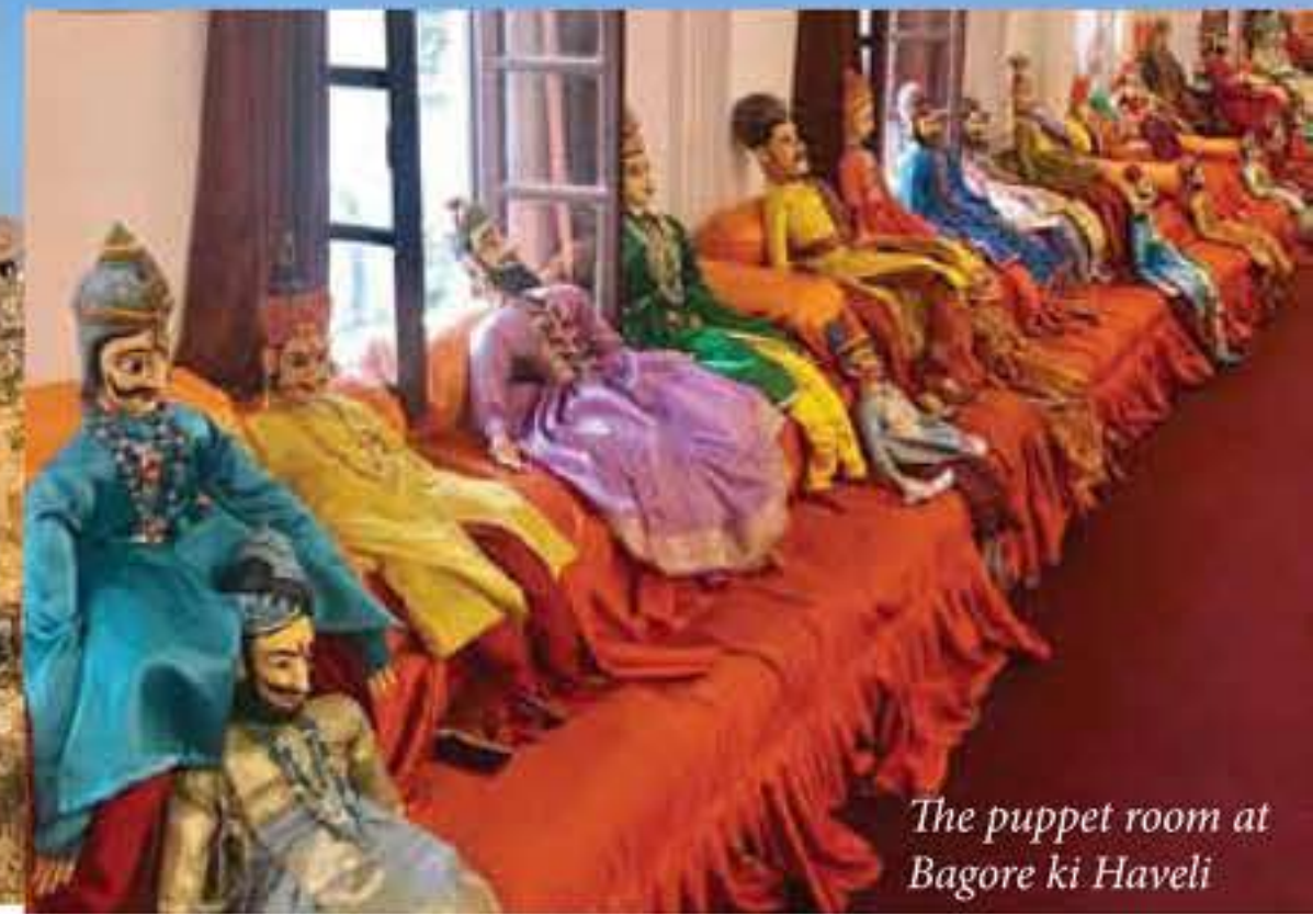
The puppet room at Bagore ki Haveli