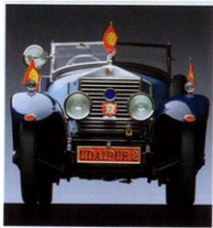
WINNER TAKES ALL: The 1924 RR 20 HP GLK 21, which made a transatlantic trip