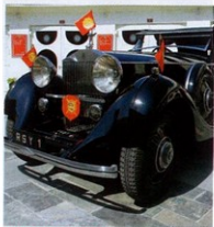
GHOST WHO WALKS: The 1934 RR Phantom II featured in Bond flick Octopussy

lone battle for us but just see how popular the hotels are today."